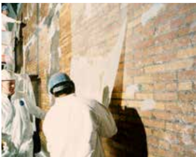
SEISMIC UPGRADING /EARTHQUAKE DAMAGE REPAIR