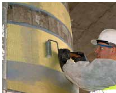
INCREASING IMPACT RESISTANCE