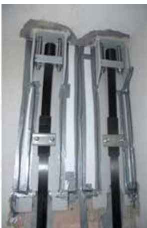
Anchorage of Sika CarboStress System