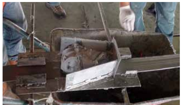
Coating of CarboDur® plates with Sikagard®