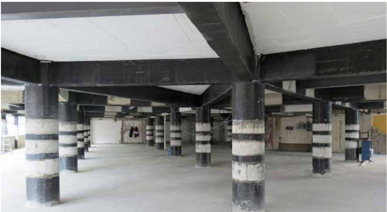
Beams and columns strengthened with SikaWrap®

International Concrete Repair Institute (ICRI): Sika won the ICRI Award of Merit in the Low-Rise Category in 2013. Click on the QR Code to learn more about Sika's ICRI Award-Winning Projects