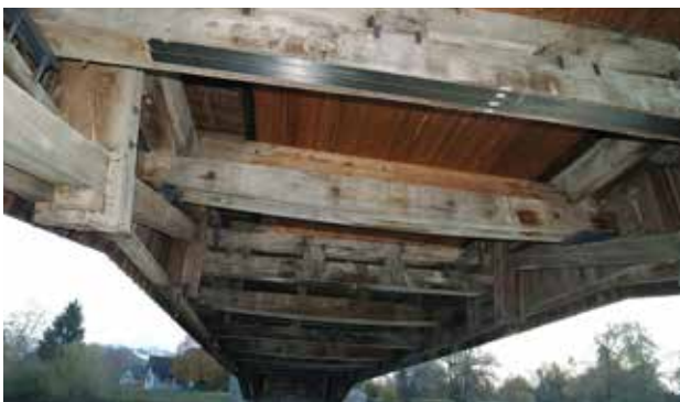
CarboDur® strengthened crossbeam