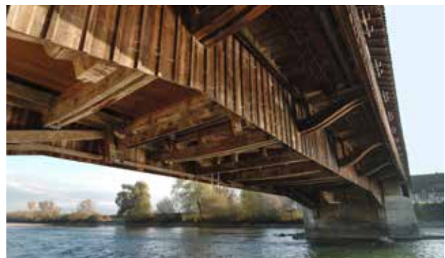
Bottom view of strengthening system