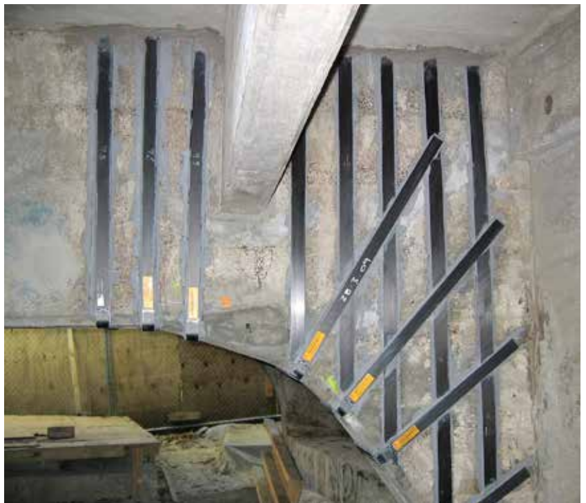
Sika CarboDur® strips and CarboShear L plates bonded to the concrete structure.