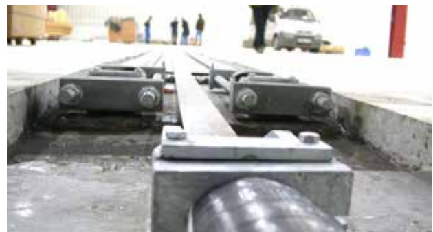
Base channel with post-tensioned CFRP plates