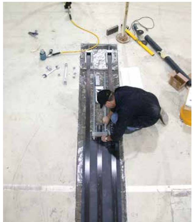
Plate and end-anchorage