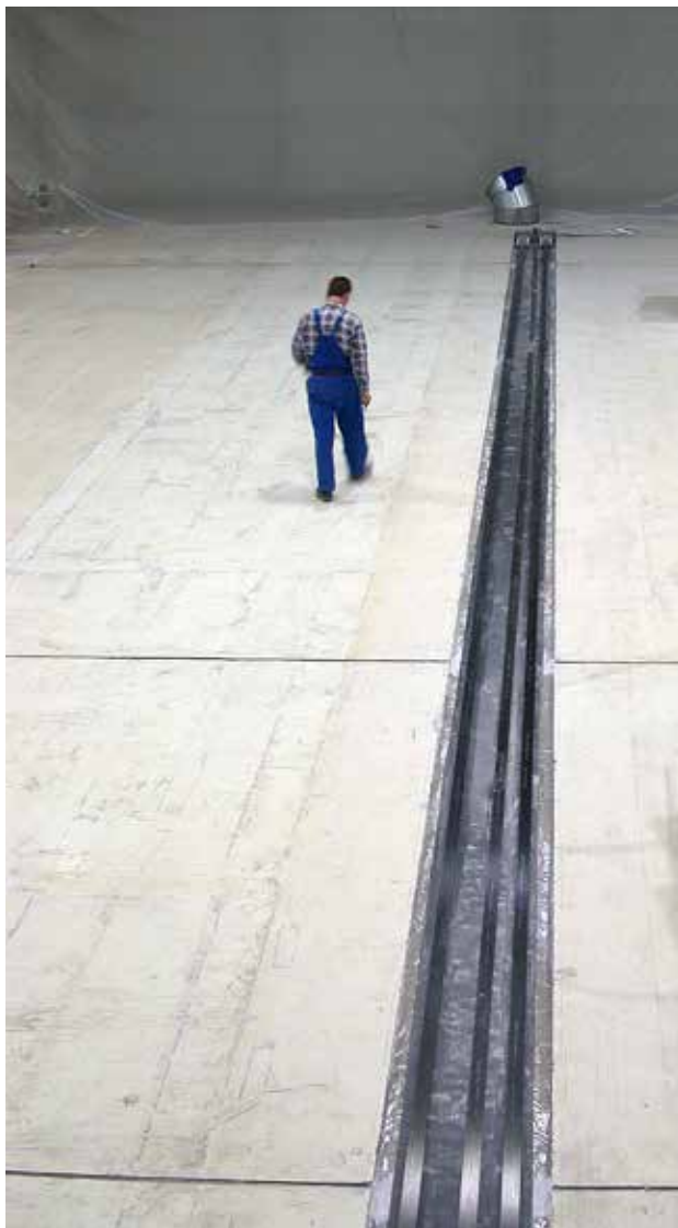
The longest post-tensioned CFRP-plates ever installed

With 29 m this is the one of the longest post-tensioned CFRP plates ever installed in the world.