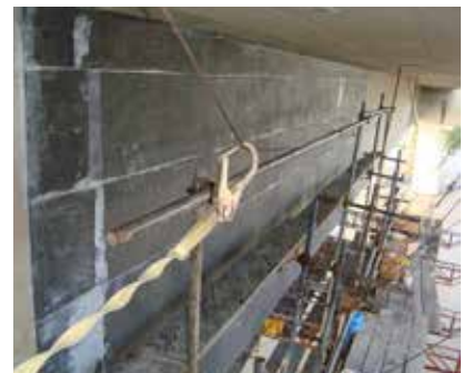
Strengthening with SikaWrap®