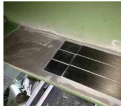
Two layers of Sika CarboDur®